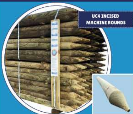
UC4 INCISED MACHINE ROUNDS