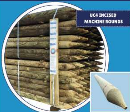
UC4 INCISED MACHINE ROUNDS