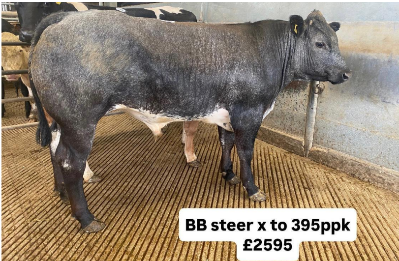
BB steer x to 395ppk £2595