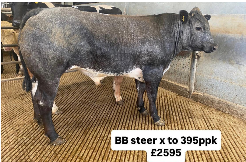
BB steer x to 395ppk £2595