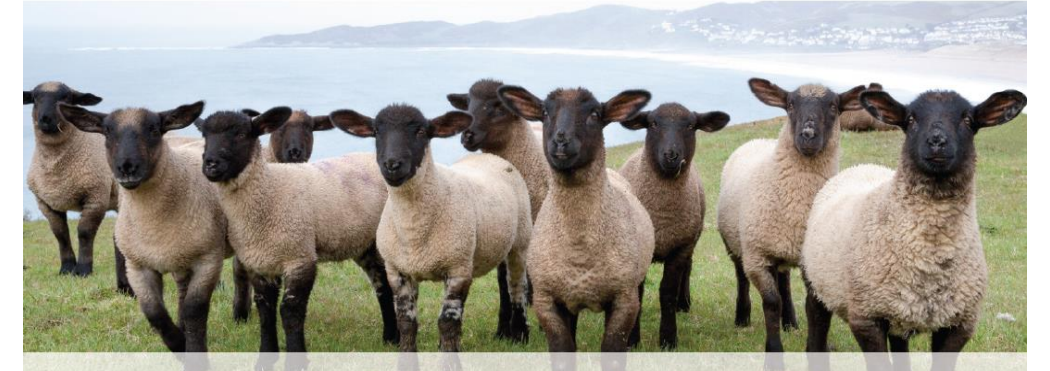
We've been insuring the farming community in Cornwall, Devon, Somerset and Dorset for more than 115 years.

0345 900 1288 | askus@cornishmutual.co.uk | www.cornishmutual.co.uk f