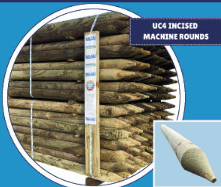
UC4 INCISED MACHINE ROUNDS