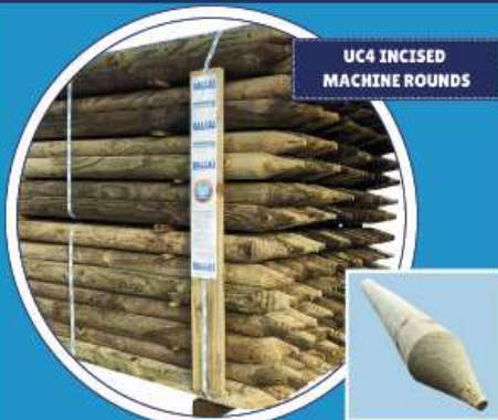
UC4 INCISED MACHINE ROUNDS