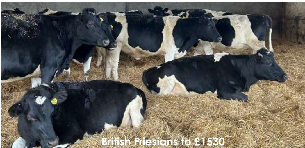
British Friesians to £1530