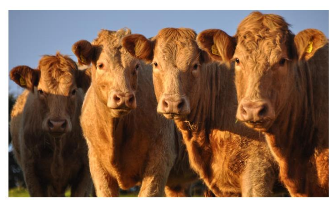
SOUTH WESTERN LIMOUSIN CATTLE BREEDERS' CLUB

Are pleased to sponsor the Suckled Calf Sales sired by a Pedigree Limousin At Frome Livestock Market